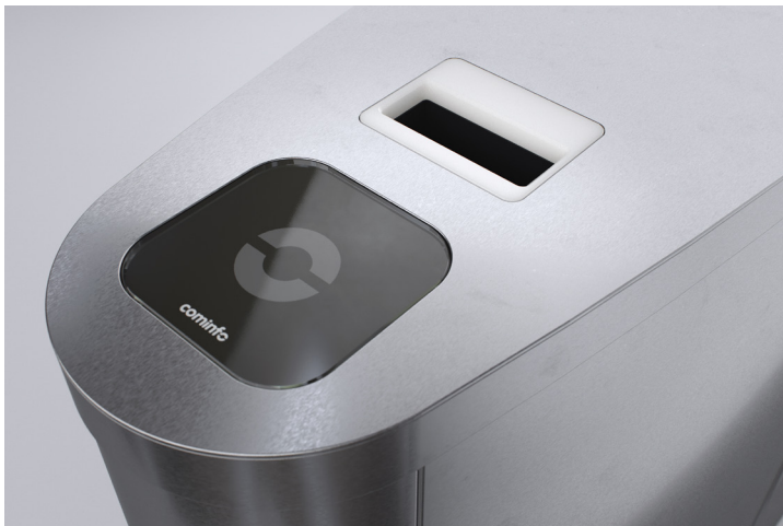
EXI Badge (Built-in)