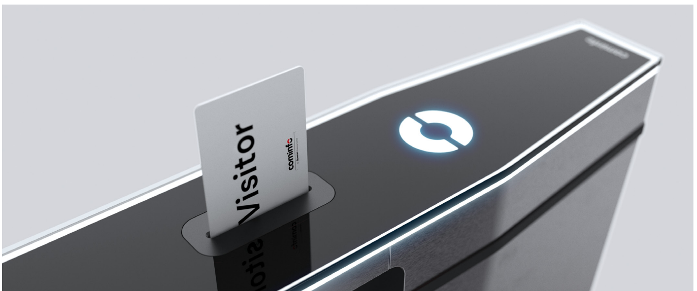
EXI Card (Built-in)