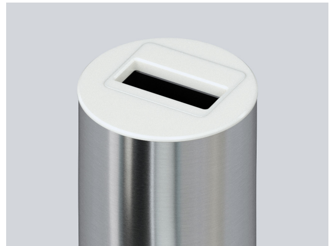
EXI Badge (Pole)